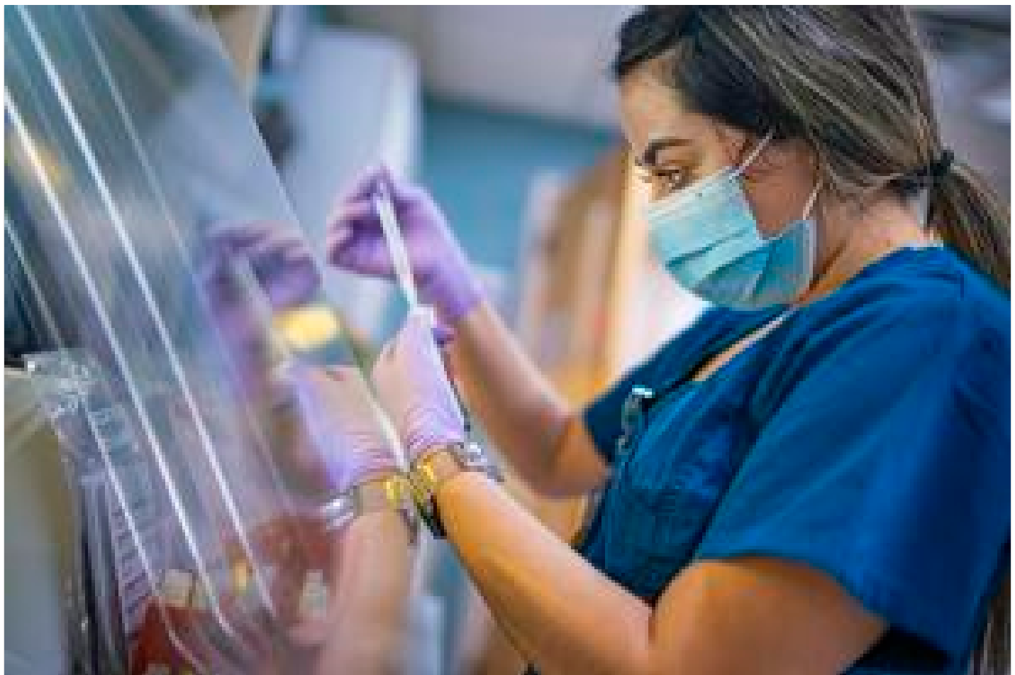
La Familia Health medical providers form a union